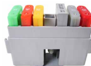
01470 6 x Maxi fuses/Breakers With Common M8 Feed