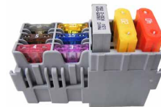
01600 3 x Maxi fuses/Breakers 6 x Auto fuses