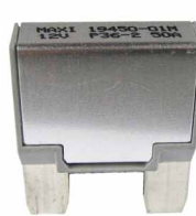
Automatic TI Metal Case (No Button)