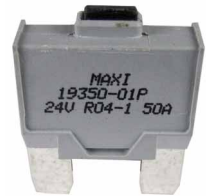
Manual TIII Plastic Case (With Reset Button)